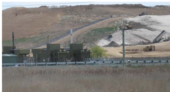
EDL Mugga Lane LFG site (see Site Inspections article on the next page).

Consistent with the Rule, the Scheme Administrator will consider proposals for approval of alternative estimation methodologies on a case by case basis. The use of the 36% engine efficiency default factor also remains an option for those organisations who do not wish to use the other two options.