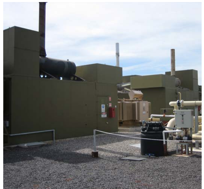
Mugga Lane LFG site generating system

As part of the Scheme Administrator's role in monitoring accreditation compliance with the Scheme, our staff recently undertook site inspections at two of Energy Developments Ltd's (EDL) accredited generating systems located at Jacks Gully (in outer Sydney) and Mugga Lane (in the ACT). The primary purpose of these site visits was to confirm generating unit numbers and nameplate ratings (given EDL notification of expansion in capacity at these generating systems). Metering equipment and data collection systems were also inspected to confirm compliance with Scheme requirements.